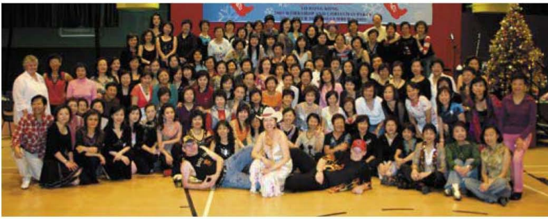
International Line Dance News from onLinedancer Magazine